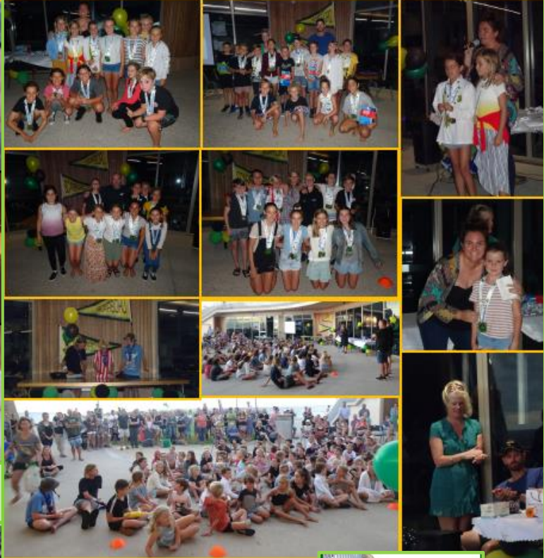
2019/20 #Woodside Nipper Wind Up and Club Championship Awards.